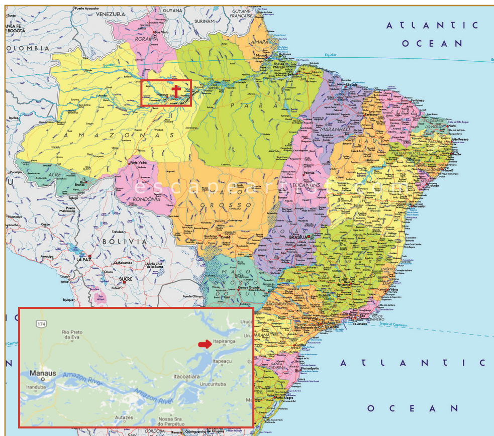
Map of Brasil showing location of Itapiranga (blow-up view bottom, left): http://www.mappi.net/img/bresil/grande_carte_bresil_avec_petites_villes_rivieres.jpg

The spouse of Mary did not ignore the current world ▶